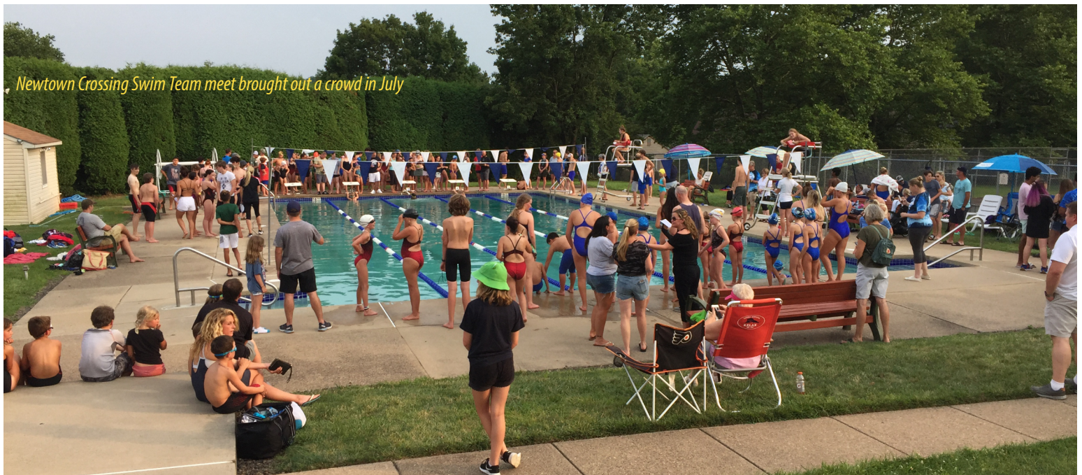
Newtown Crossing Swim Team meet brought out a crowd in July