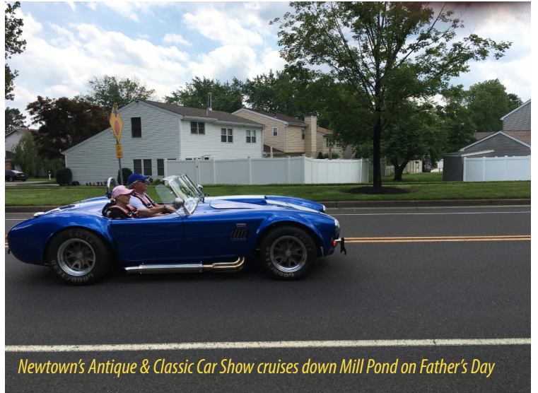
Newtown's Antique & Classic Car Show cruises down Mill Pond on Father's Day